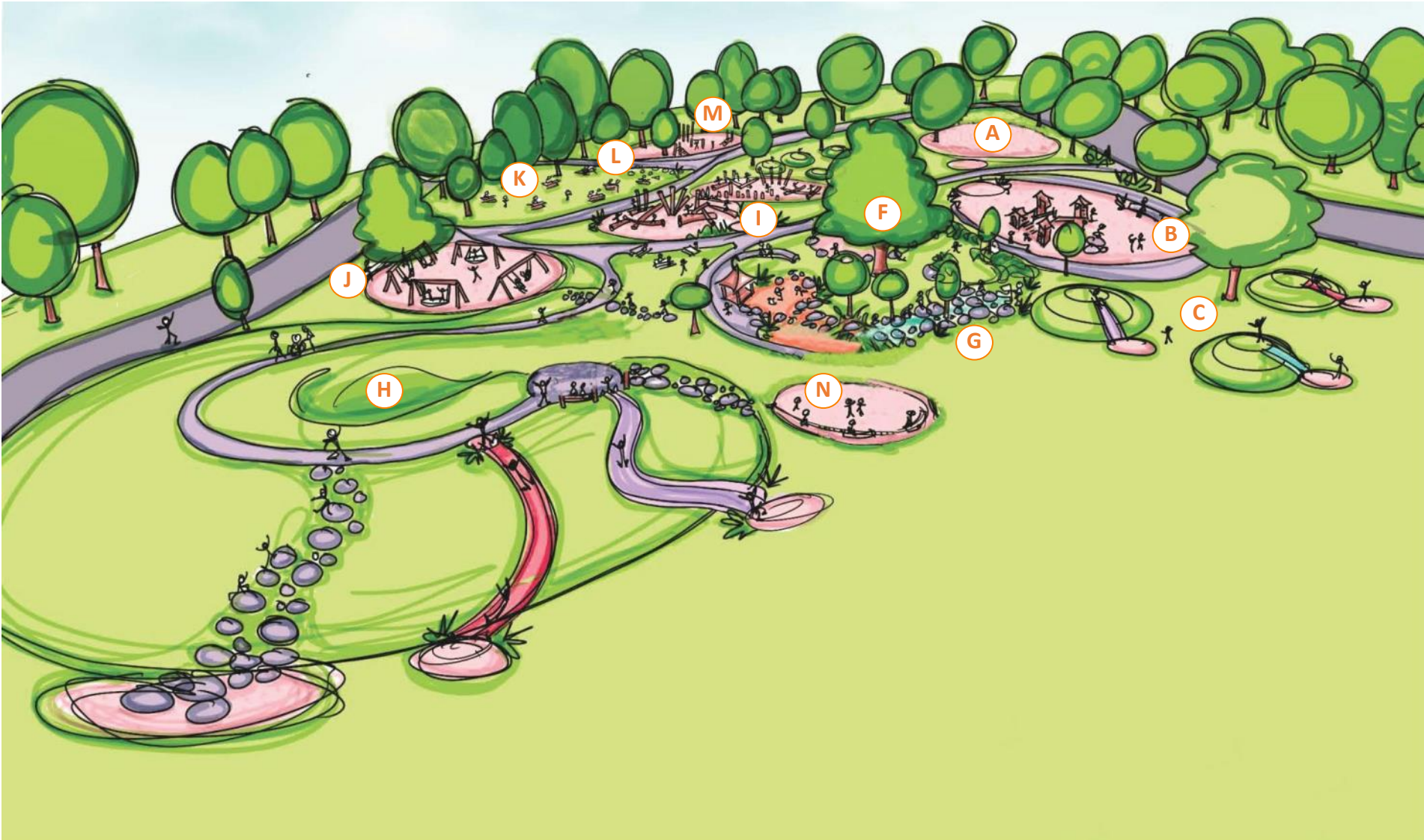
Rendering —Aerial View, Looking North