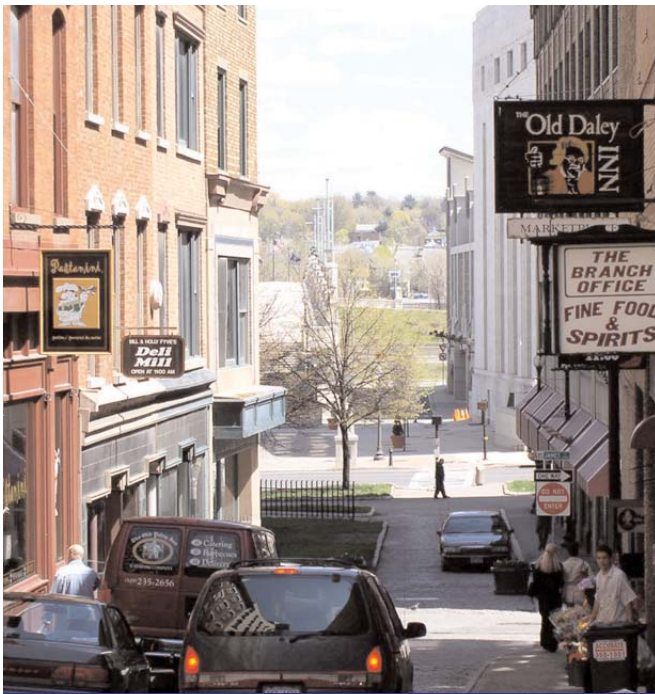
Maiden Lane, downtown