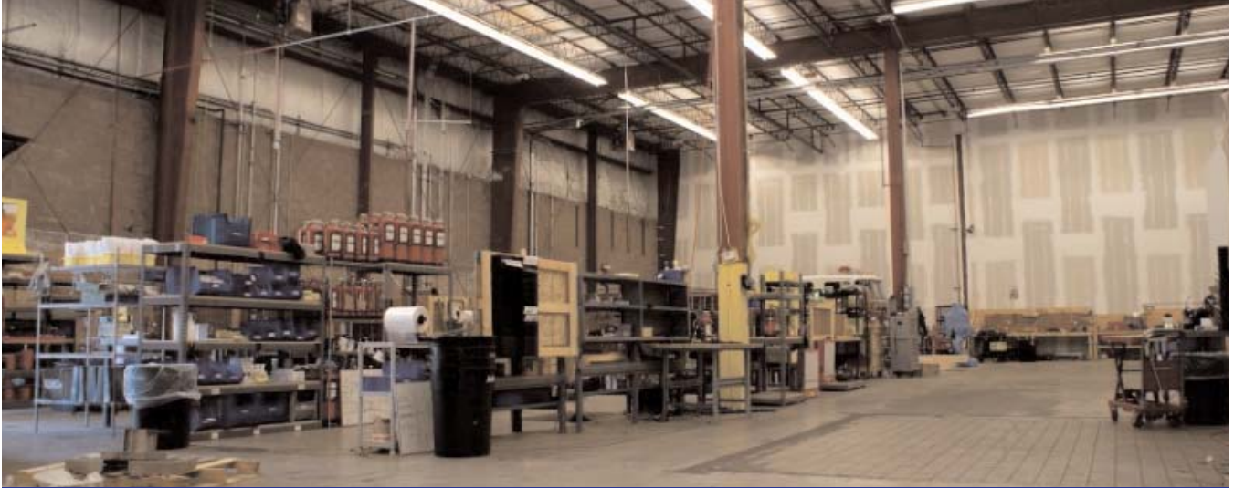
BullEx Digital Safety