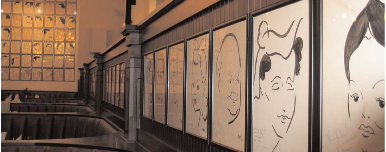
Hollywood Brown Derby