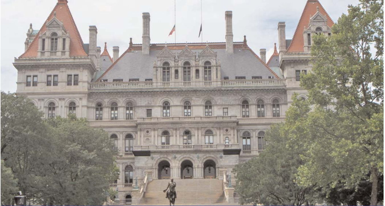
New York State Capital Building