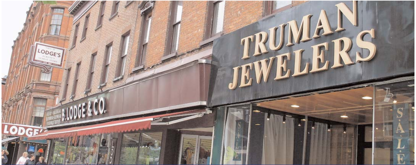
Businesses along North Pearl Street