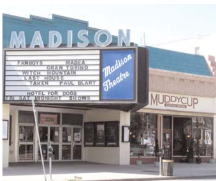
Madison Theatre and Muddy Cup