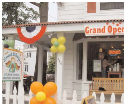
Emack & Bolios