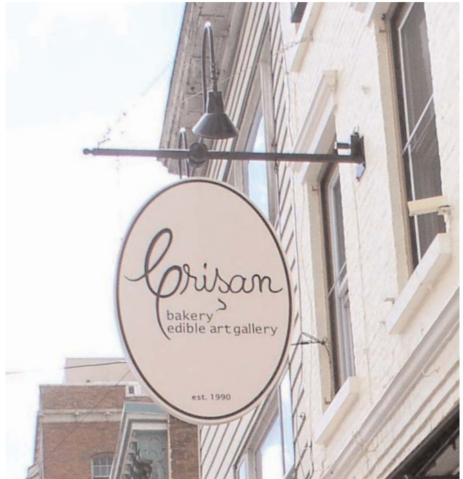
Cafe Crisan Bakery