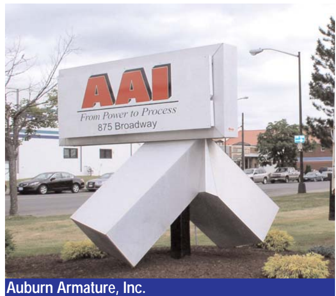
Auburn Armature, Inc.

Albany-Colonie Regional Chamber of Commerce is a not-for-profit membership organization whose goal is to help businesses do business. Founded in 1900, The Chamber is the region's leading business organization with nearly 2,500 business members who employ more than 120,000 local residents. From small business to big issues, the Chamber strives to improve the Capital Region's economy, business climate and quality of life. The Chamber provides educational and networking opportunities, health insurance programs, legislative advocacy, loan programs and more, all designed to help businesses prosper. For more information, call (518) 431-1400 or visit www.acchamber.org .