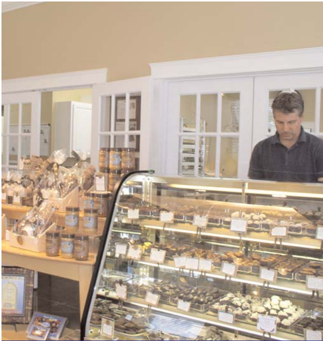
The Chocolate Gecko