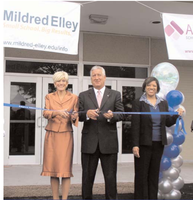
Mildred Elley and Austin Beauty School