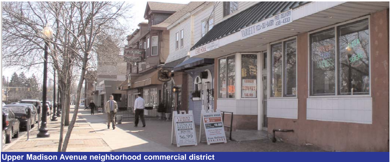
Upper Madison Avenue neighborhood commercial district

Cornell Cooperative Extension of Albany A community-based educational organization, the Cooperative Extension offers a SmallBusiness Start-up Seminar for entrepreneurs on a quarterly basis. The one-day course provides guidance for first-timers considering investing time and money in starting a business. For more information, call (518) 765-3500, or visit www.albanycounty.com .