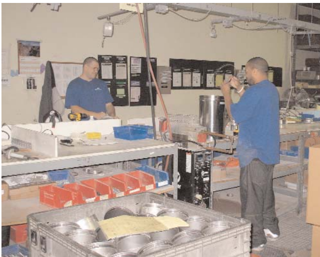
ProTech Systems a division of Simpson-Dura-Vent

To verify the license of a professional and to learn more about who must be licensed and currently registered to offer professional services and/or use the professional title, contact the New York State Education Department, Office of the Professions at (518) 474-3817 or visit www.op.nysed.gov .