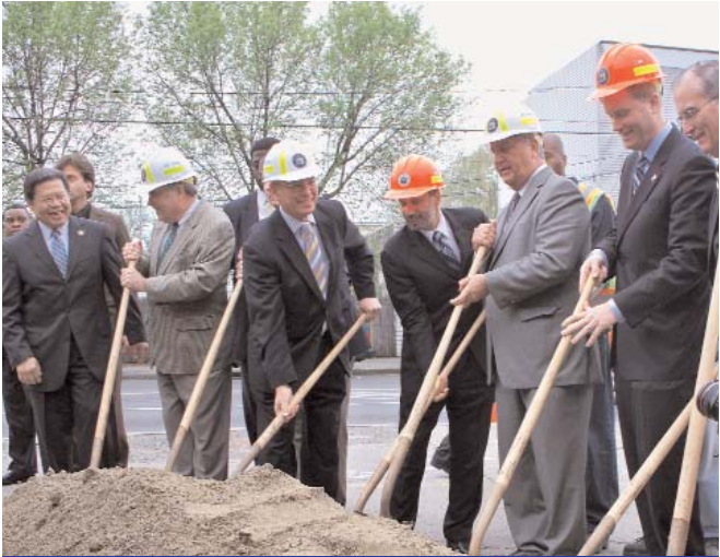
Stimulus Groundbreaking on Delaware Avenue