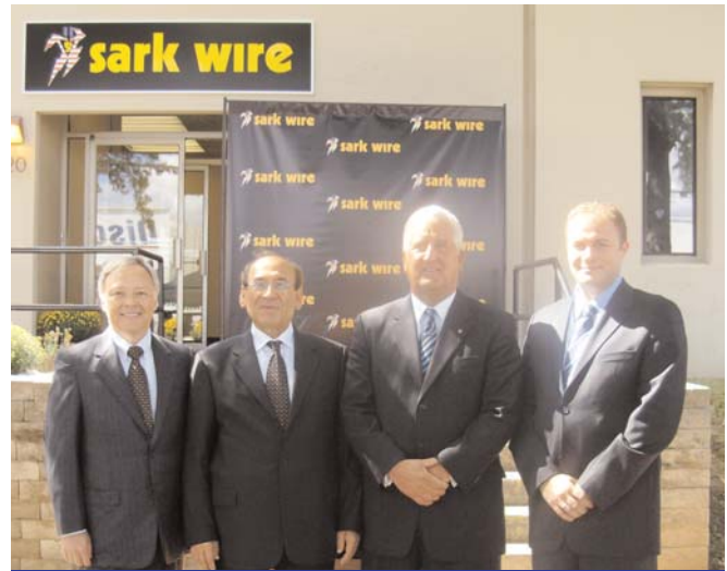
Sark Wire Corporation