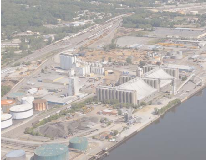
Port of Albany