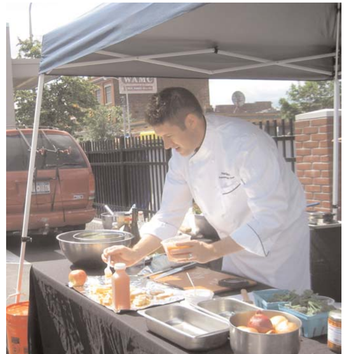
Central Avenue Farmers' Market